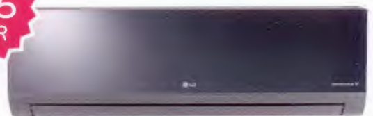
Art Cool™ Mirror High Efficiency Wall-Mounted Indoor Units