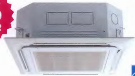
Ceiling Cassette Indoor Units