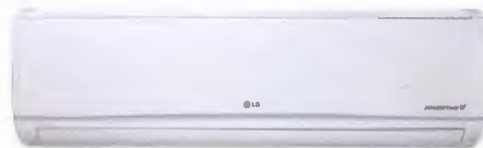
Flex Multi Architectural Gloss White Wall-Mounted Indoor Units