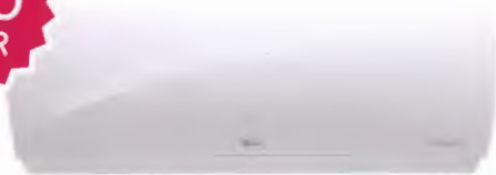
Prestige Hyper Efficiency Wall-Mounted Indoor Units