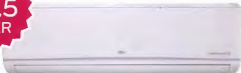
Architectural Gloss White High-Efficiency Wall-Mounted Indoor Units