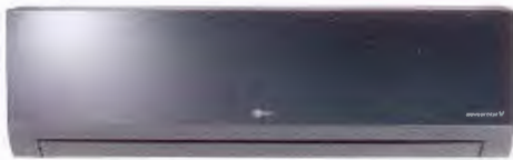
Flex Multi Art Cool™ Mirror Wall-Mounted Indoor Units

Select from a variety of elegant, quiet indoor units to complement your lifestyle. Your choice is not limited to any one type of indoor unit-mix and match four unit styles as you need.