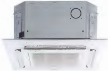
Flex Multi Ceiling Cassette Indoor Units