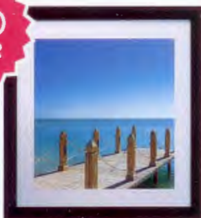
Art Cool™ Gallery Indoor Units