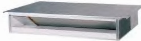
Flex Multi Ducted Indoor Units